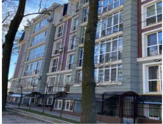
The preliminary cost of the works is €92,679